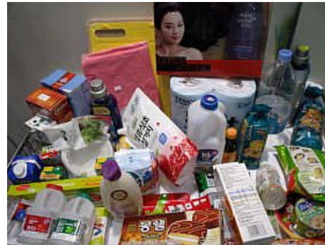
CFP products overseas (2)