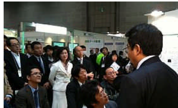
Lessons in classroom