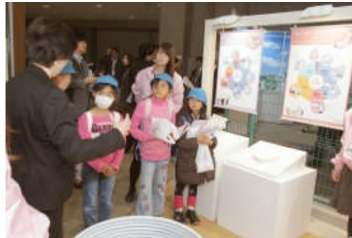
Listening explanations from a teacher