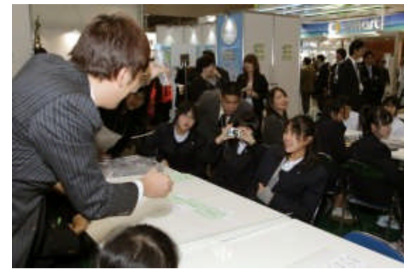
Speech by the person in the company displaying CFP mark