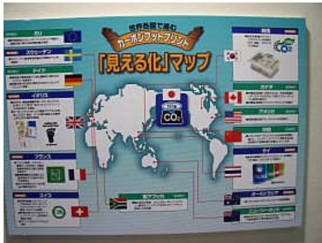
World map of efforts of “Visualization of Carbon Footprint of Products”