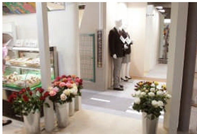
Supermarket (street side)