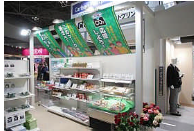
Supermarket (right side)