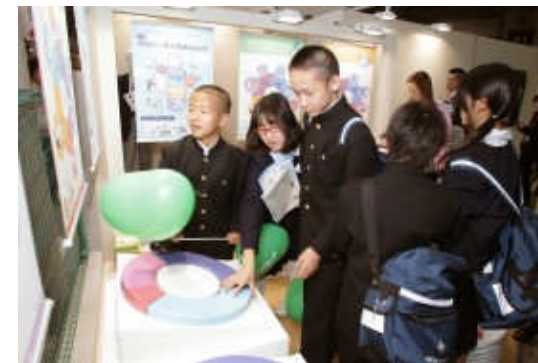
Junior high-school student also tried it!