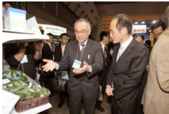
Former Miyazaki Governor Higashikokubaru