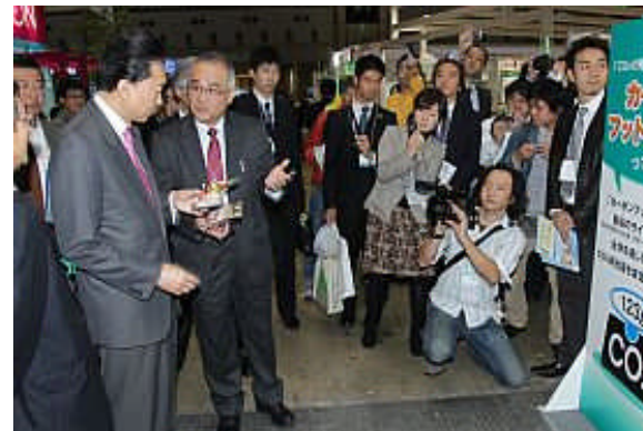
Former Prime Minister Hatoyama