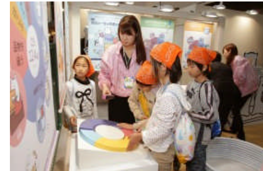
Fitting pieces together...is this a different piece?