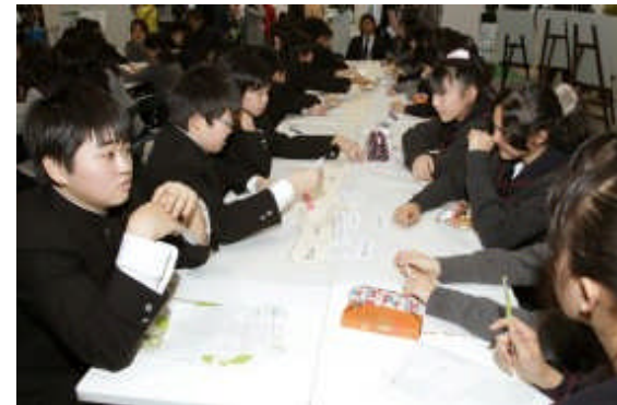
Group working “entire life cycle of a product”