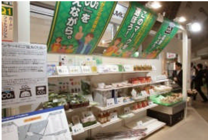
Supermarket (left side)