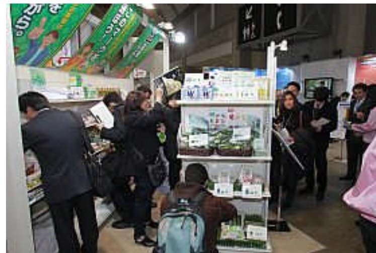
Exhibition of CFP products