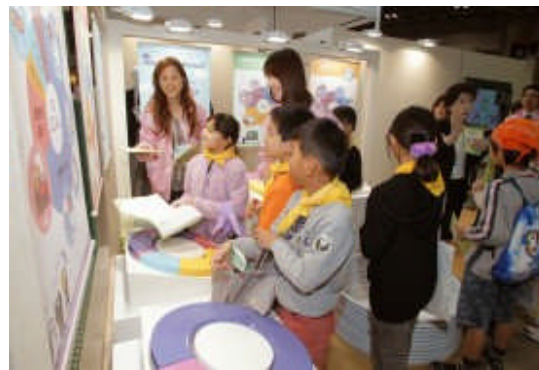
Answered all the questions correctly!