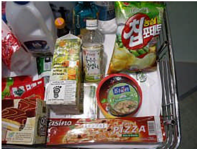
CFP products overseas (1)