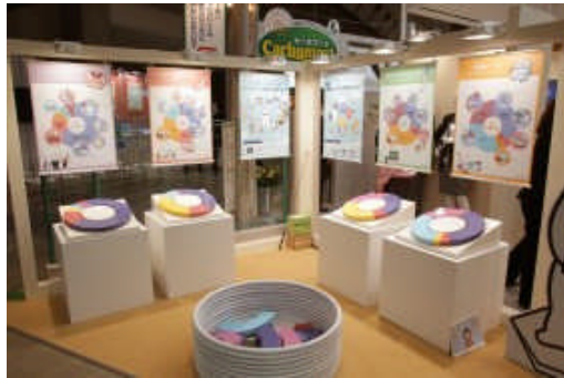
Children's eco-learning corner