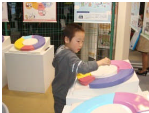
Which piece is correct?